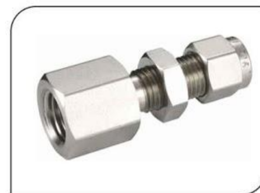
Female Bulkhead Connector