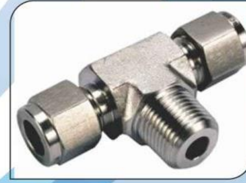
Male Branch Tee