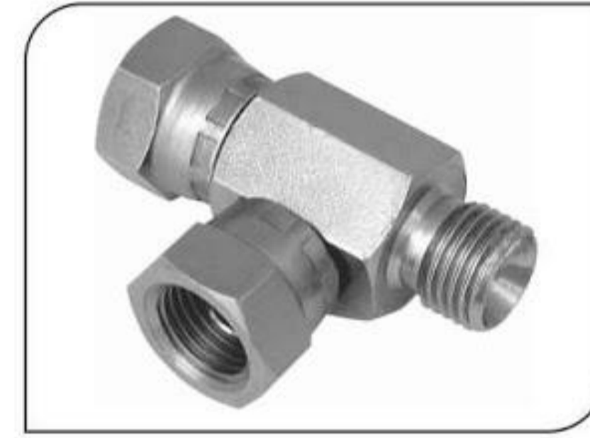
Female Run Tee