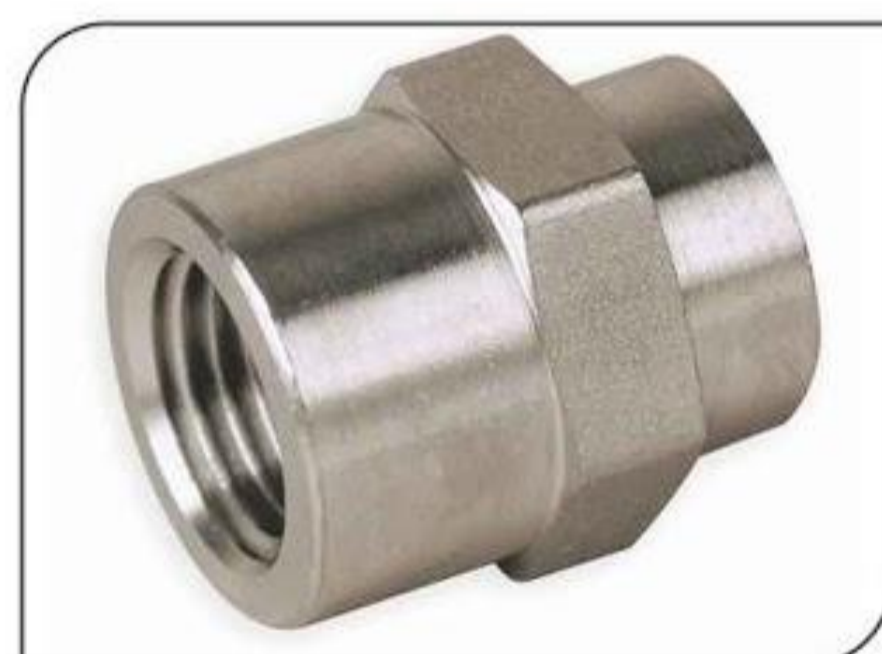
Reducing Hex Nipple