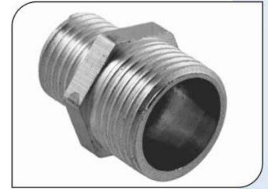
Reducing Hex Coupling