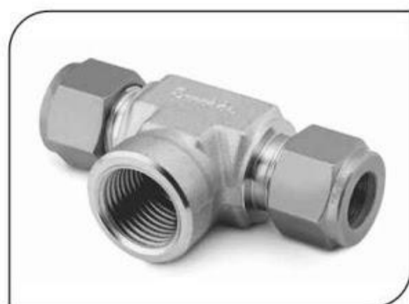
Female Branch Tee