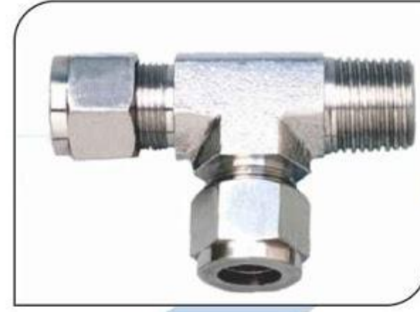
Male Run Tee