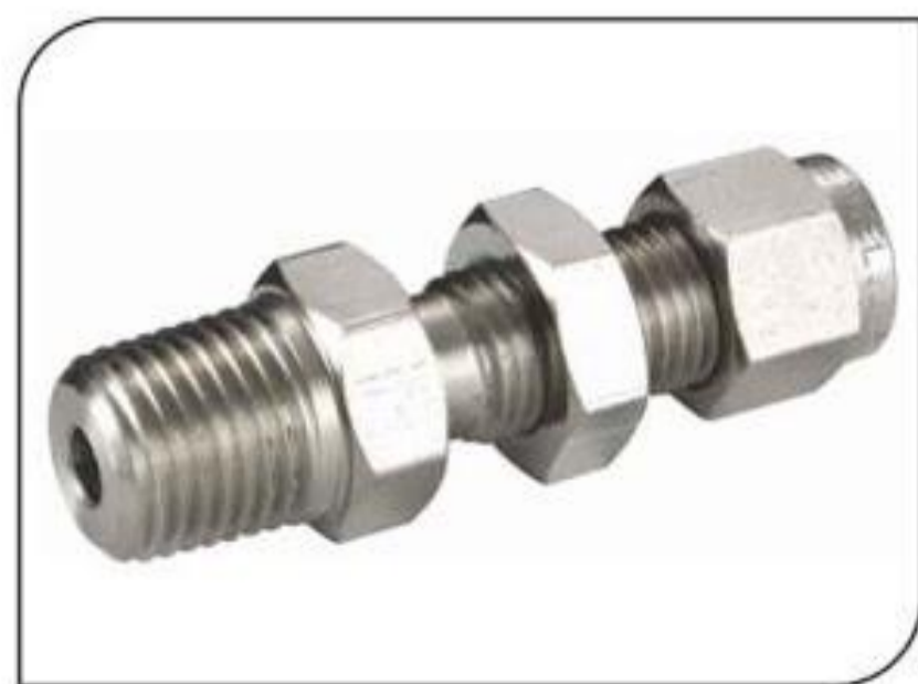
Male Bulkhead Connector